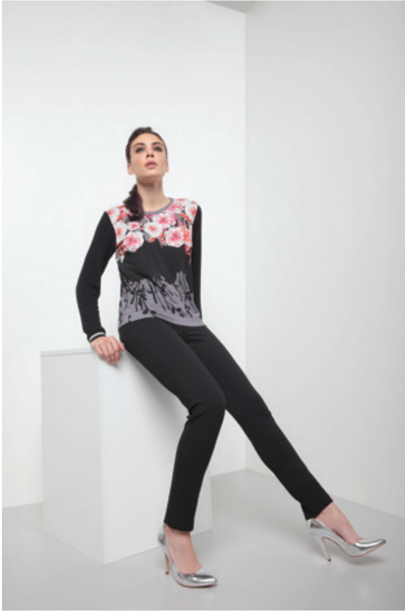
Maglia-Pull 1189 | Pantalone-Pant 1152