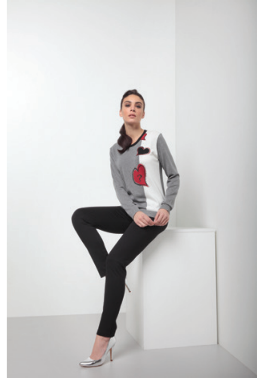
Maglia-Pull 1214 | Pantalone-Pant 1153