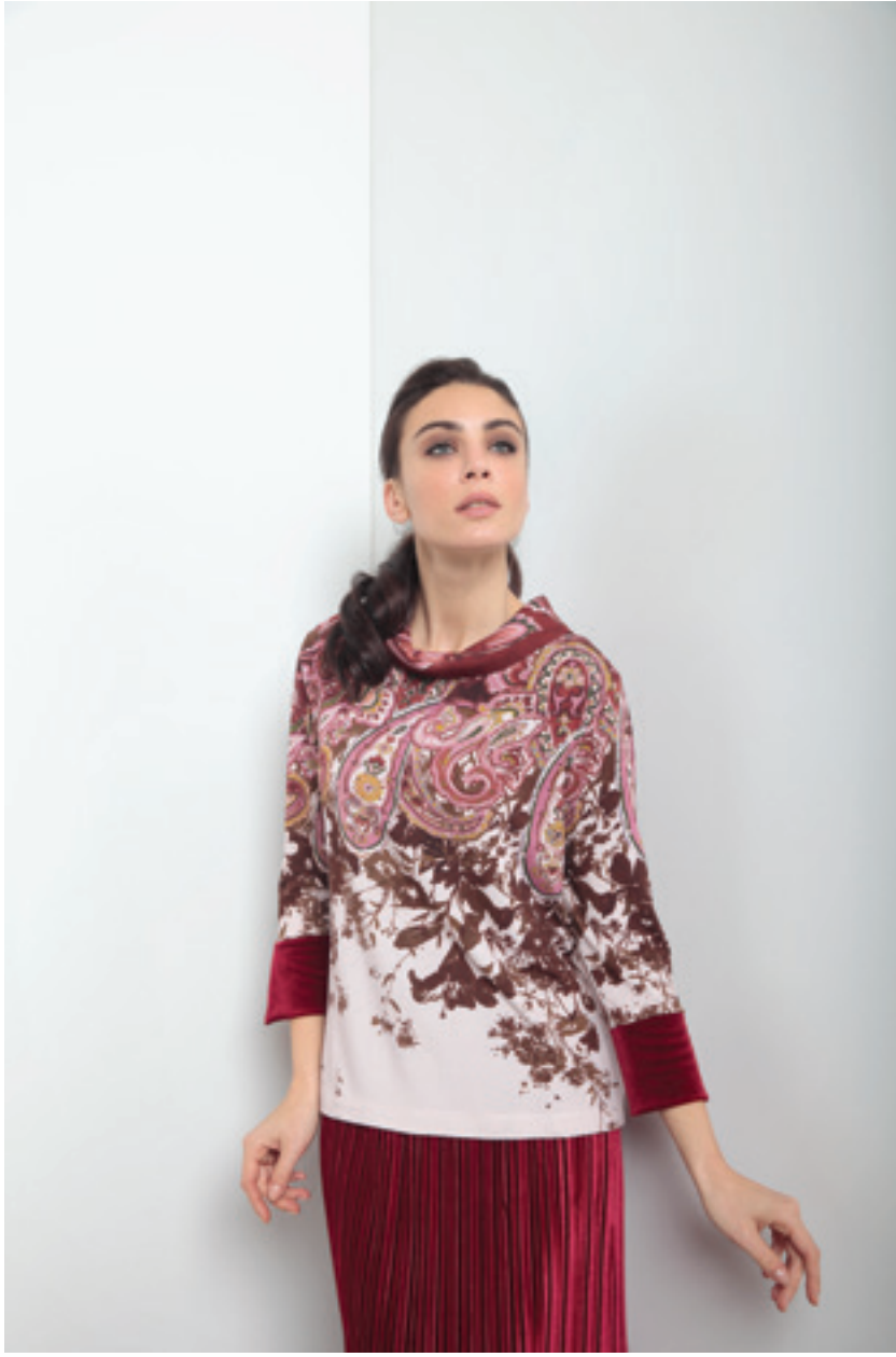
Maglia-Pull 1194 | Gonna-Skirt 1197