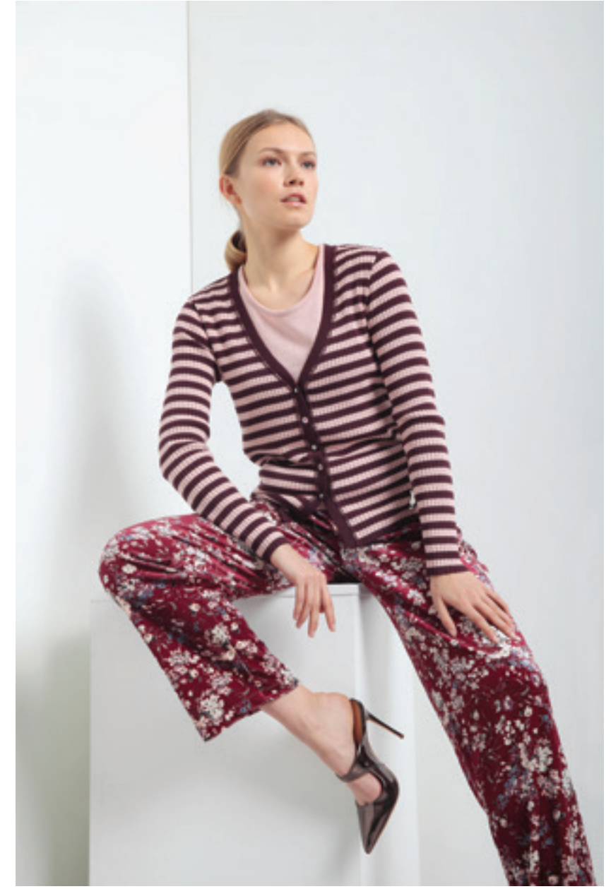
Cardigan 1182 | Top 1183 | Pantalone-Pant 1180