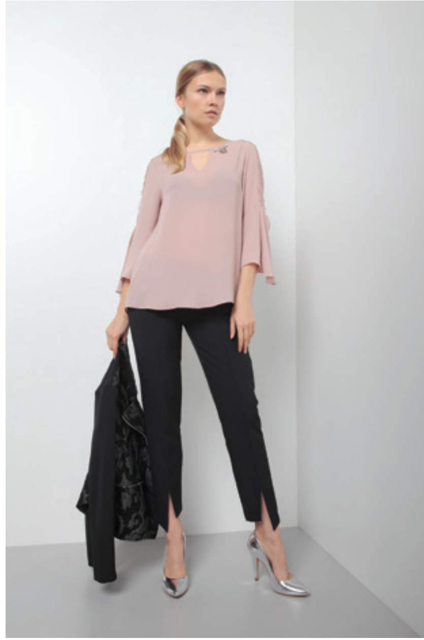
Blusa-Blouse 1170 | Giacca-Jacket 1173 | Pantalone-Pant 1172