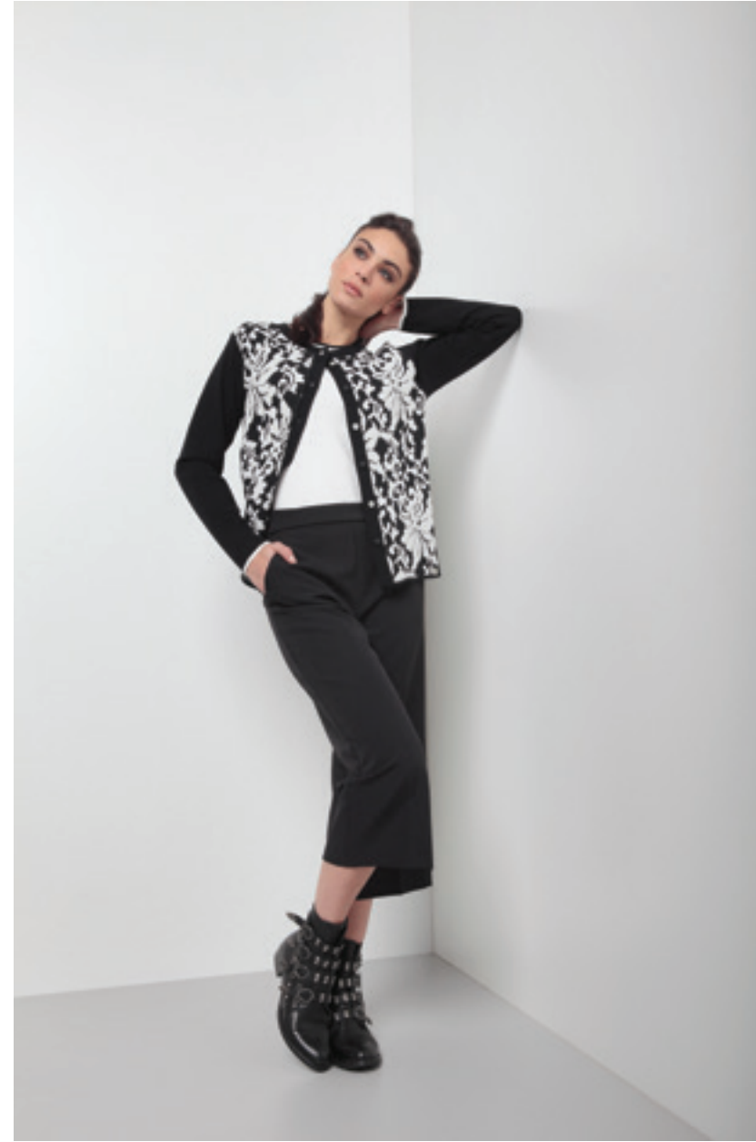
Giacca-Jacket 1220 | Maglia-Pull 1221 | Pantalone-Pant 1171