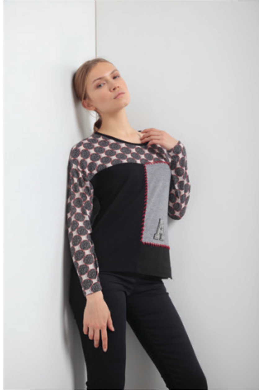
Maglia-Pull 1213 | Pantalone-Pant 1150