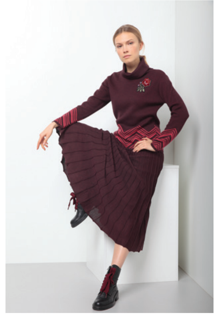
Maglia-Pull 1198 | Gonna-Skirt 1200