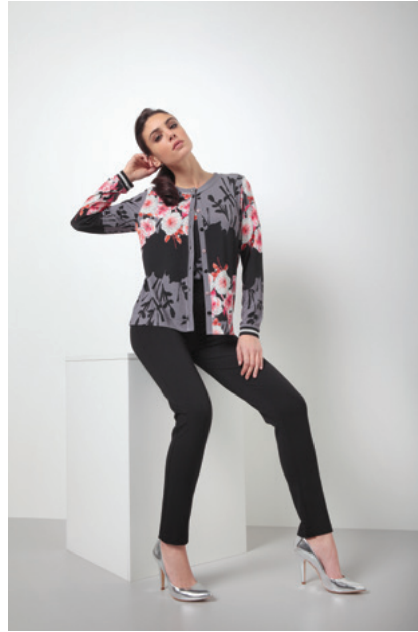
Twin-Set 1188 | Pantalone-Pant 1157