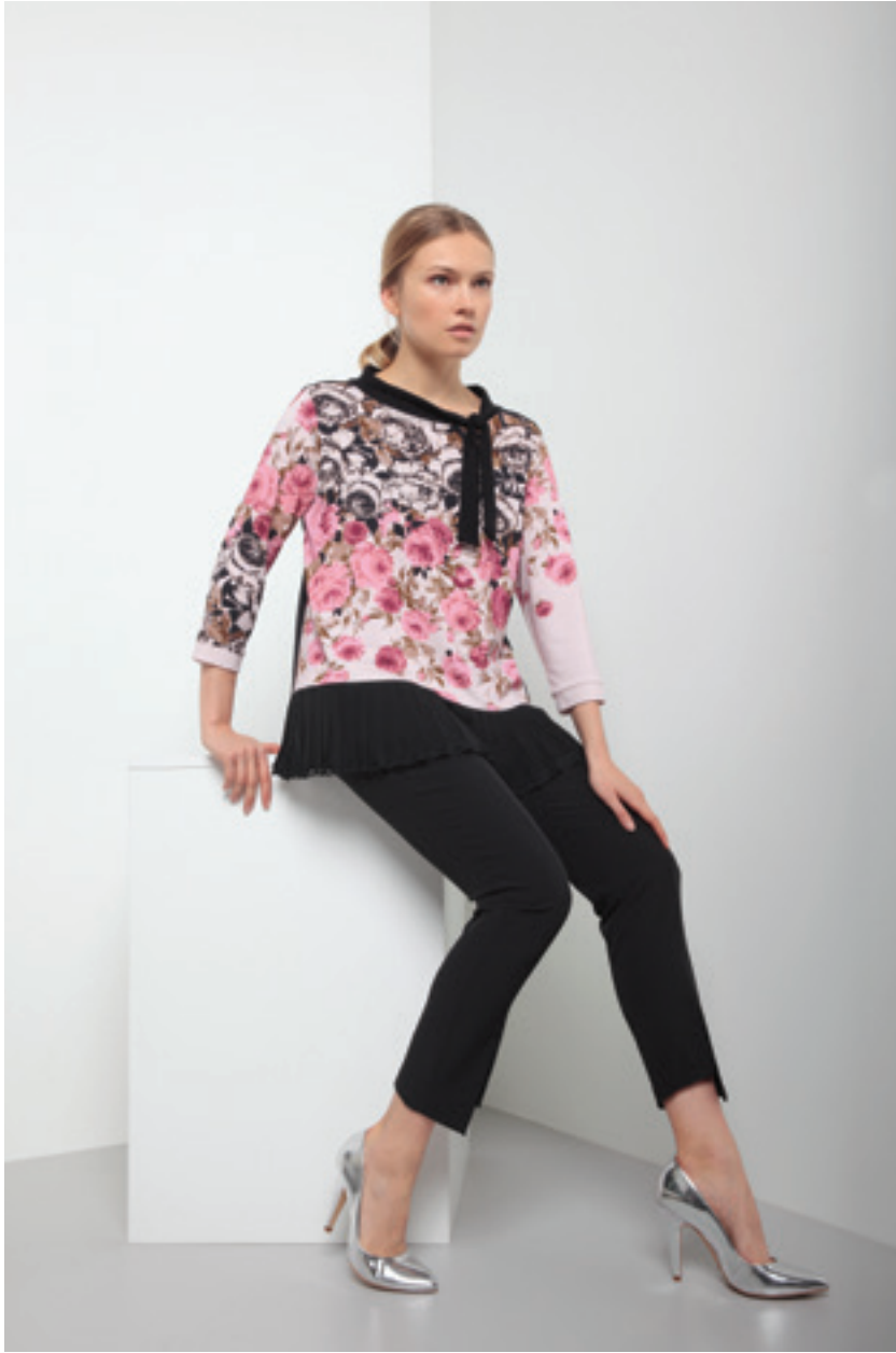
Maglia-Pull 1196 | Pantalone-Pant 1172