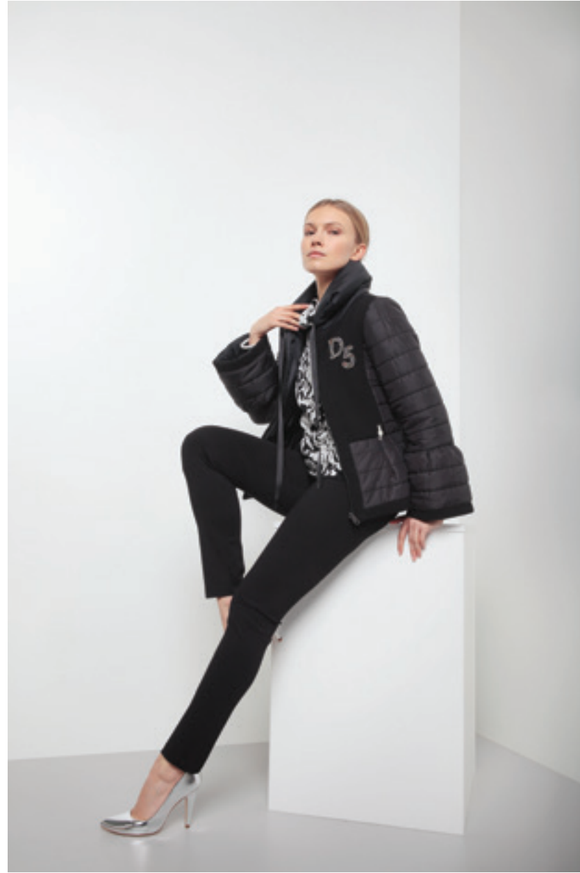
Giacca-Jacket 1163 | Maglia-Pull 1219 | Pantalone-Pant 1150