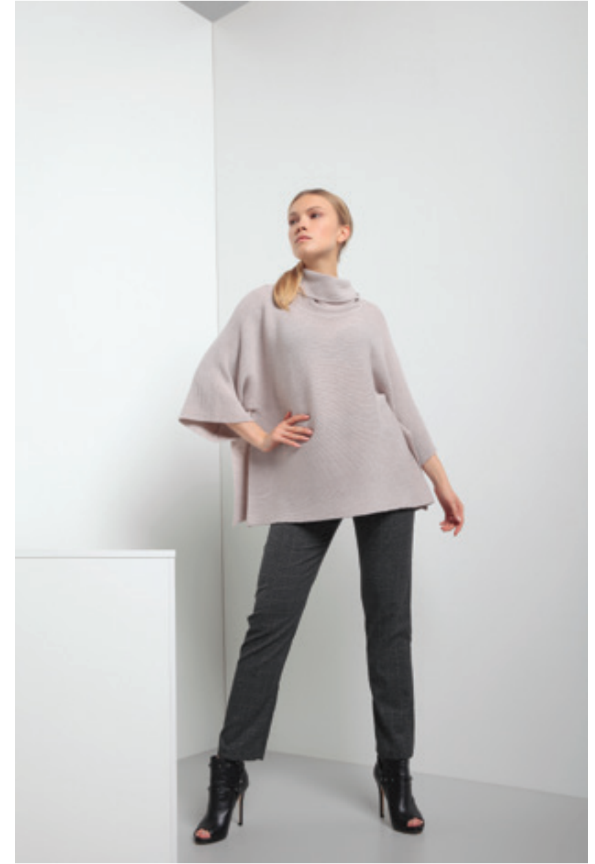
Maglia-Pull 1232 | Pantalone-Pant 1155