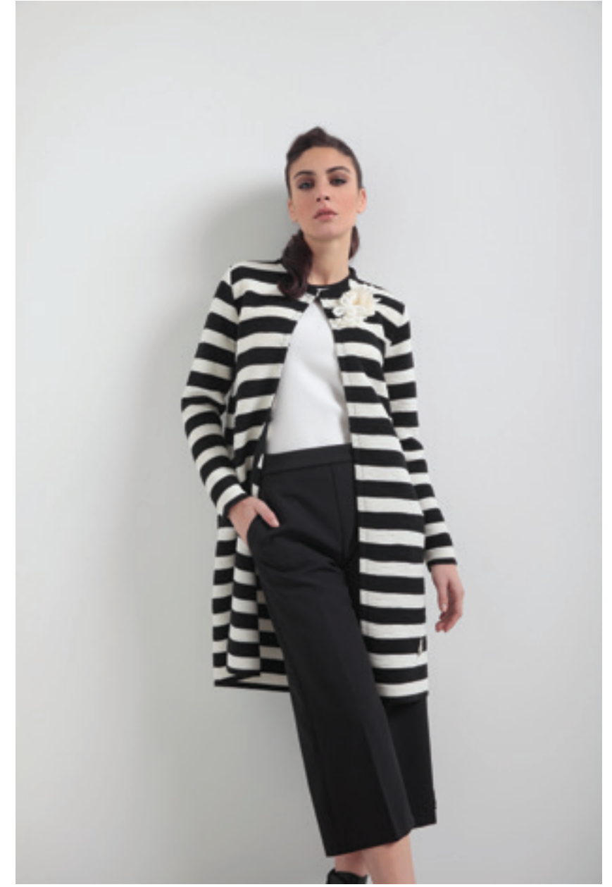
Long Cardigan 1184 | Maglia-Pull 1221 | Pantalone-Pant 1171