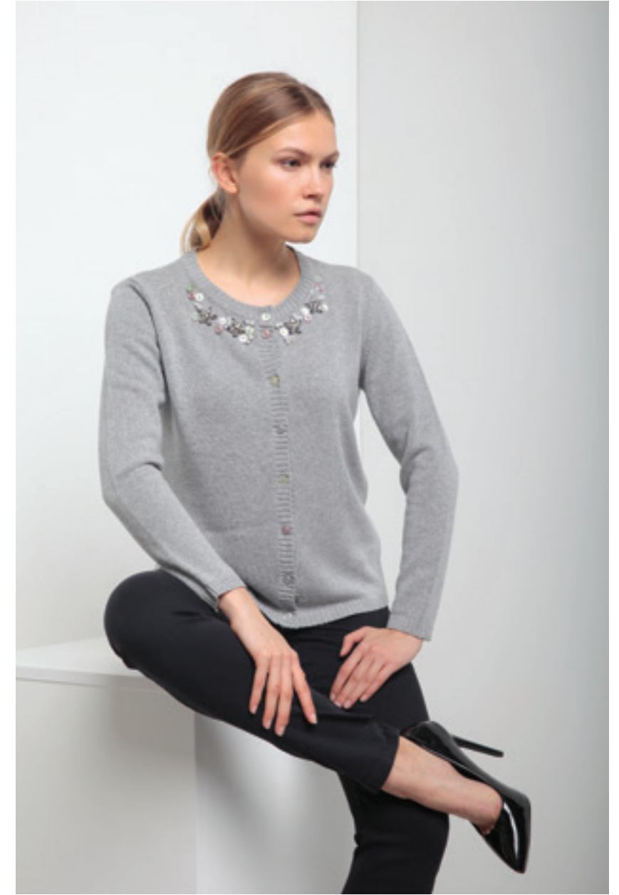
Cardigan 1218 | Pantalone-Pant 1152