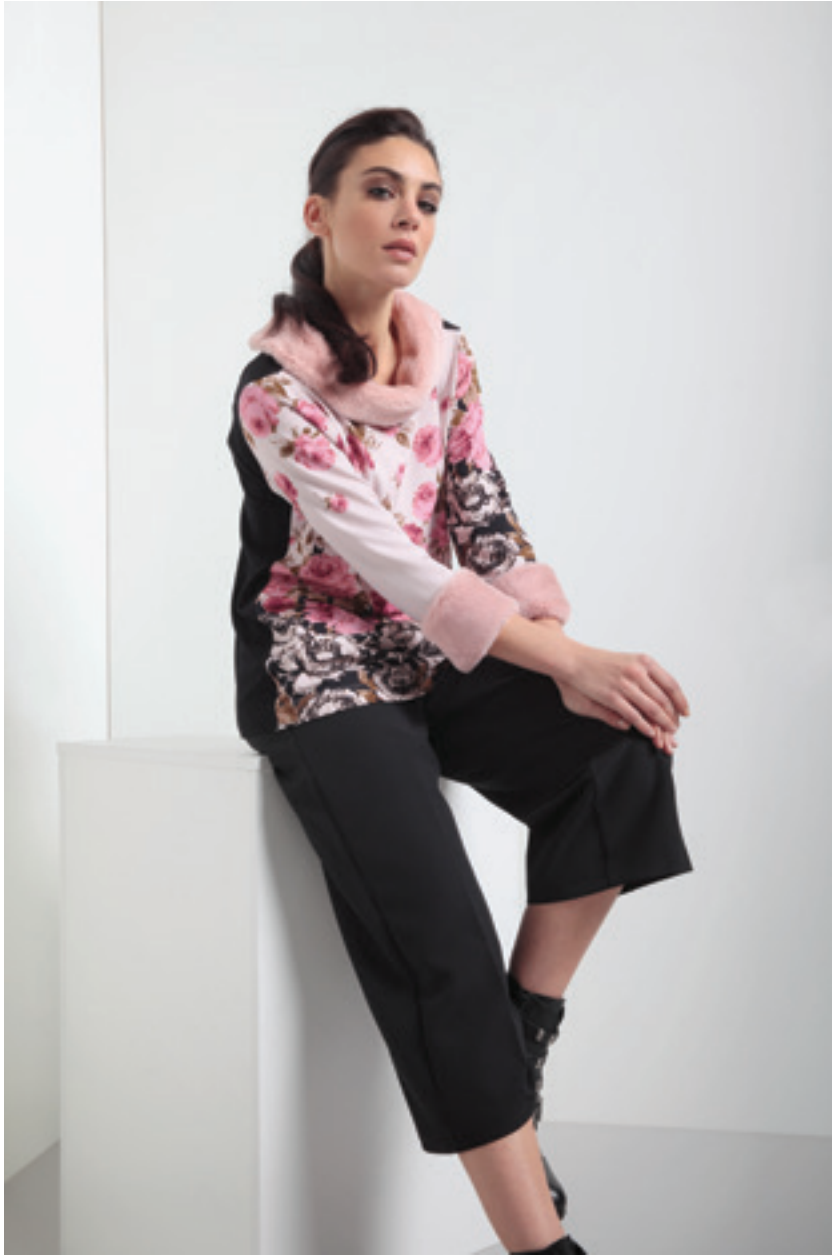
Maglia-Pull 1236 | Pantalone-Pant 1171