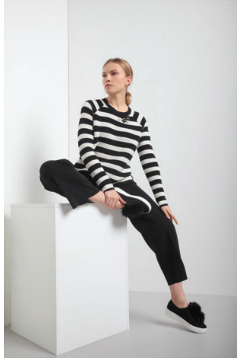
Maglia-Pull 1185 | Gaucho 1186