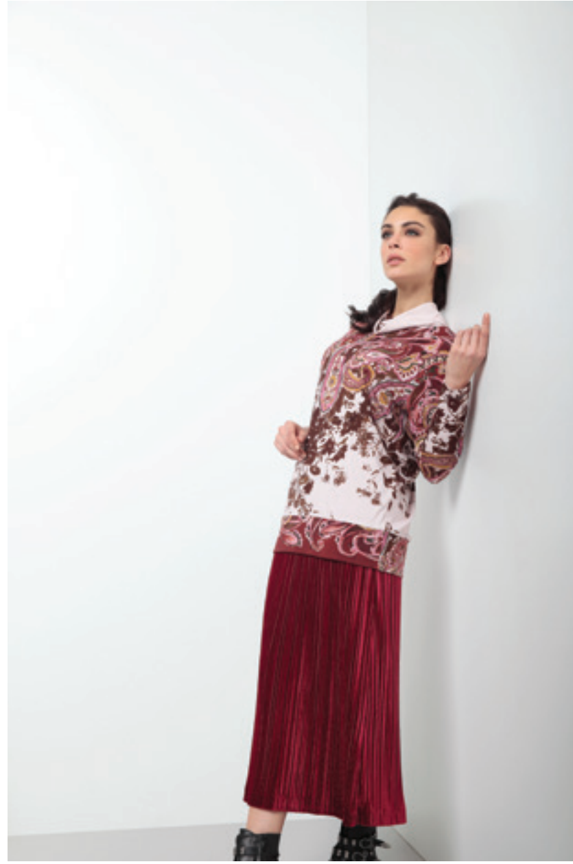
Maglia-Pull 1192 | Gonna-Skirt 1197