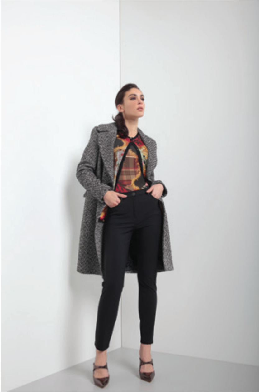
Cappotto- Coat 1239 | Twin-Set 1240 | Pantalone- Pant 1150