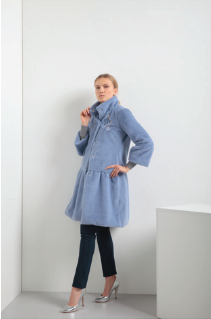
Giacca-Jacket 1176 | Jeans 1166