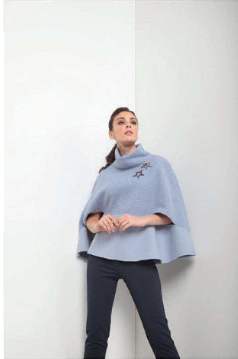
Cappa-Cape 1195 | Pantalone-Pant 1158