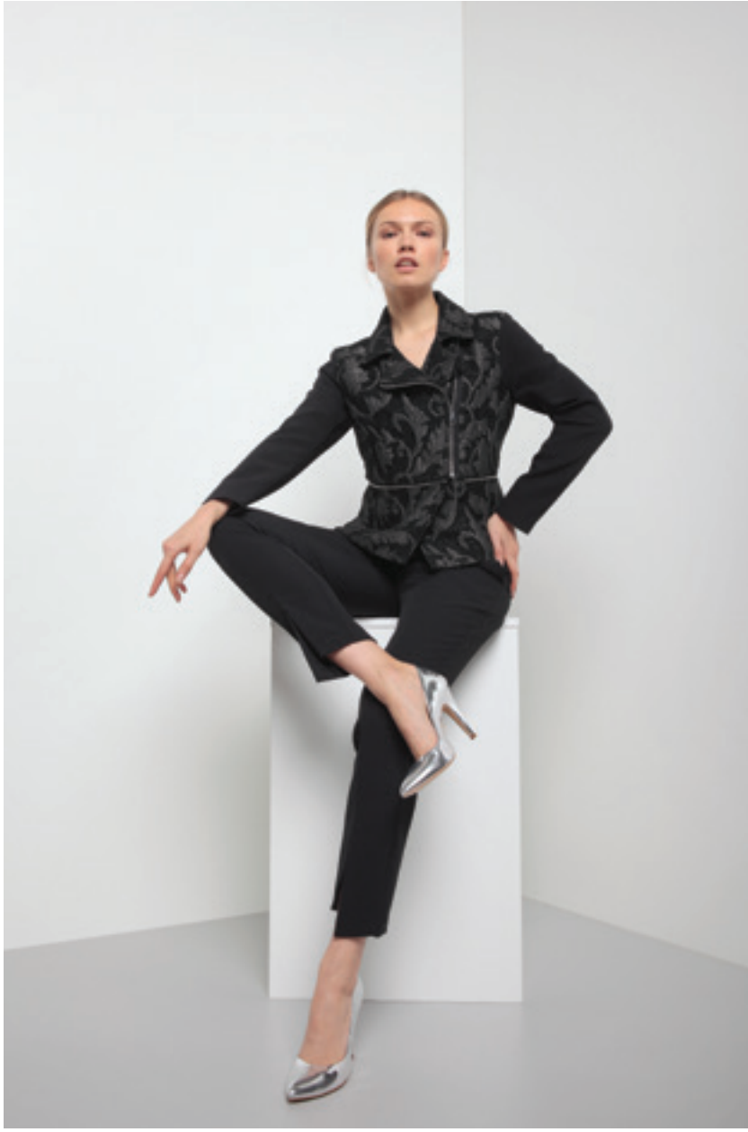
Giacca-Jacket 1173 | Pantalone-Pant 1172