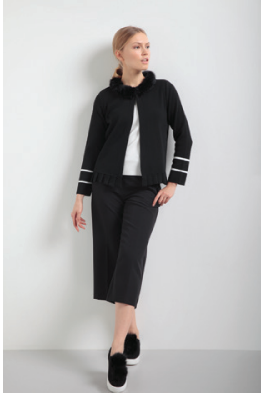
Giacca-Jacket 1224 | Maglia-Pull 1221 | Pantalone-Pant 1171