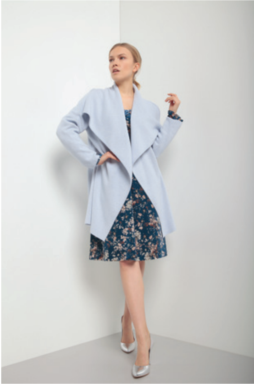
Giacca-Long Cardigan 1230 | Abito-Dress 1229