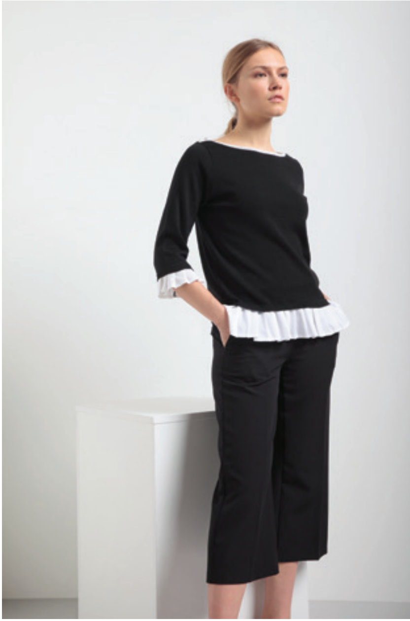
Maglia-Pull 1225 | Pantalone-Pant 1171