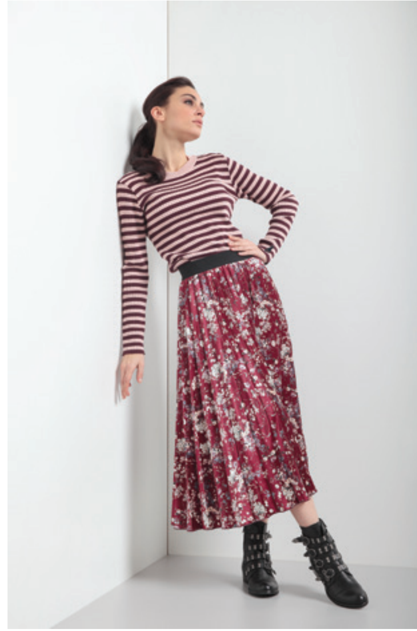
Maglia-Pull 1181 | Gonna-Skirt 1179