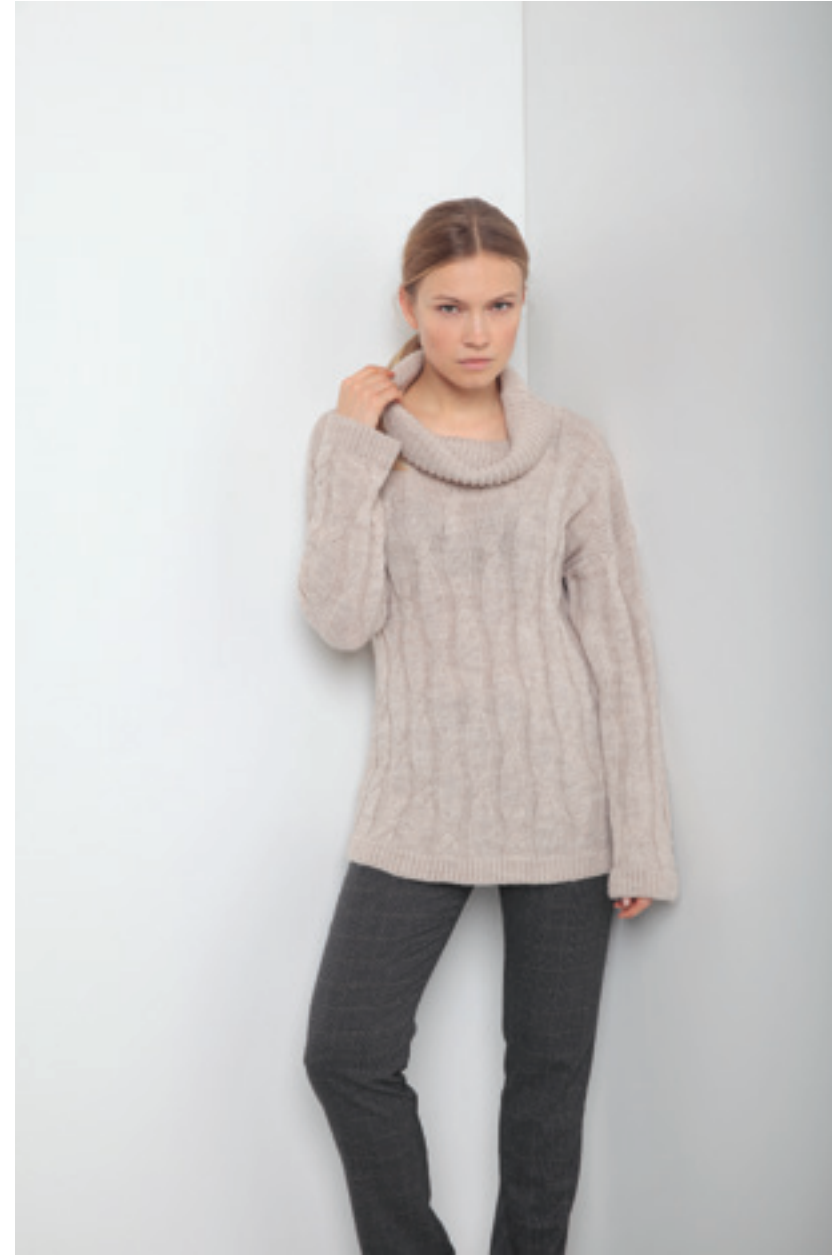
Maglia-Pull 1235 | Pantalone-Pant 1155