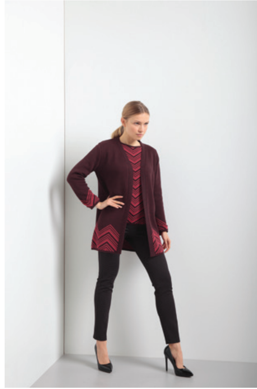
Cardigan 1201 | Maglia-Pull 1199 | Pantalone-Pant 1159