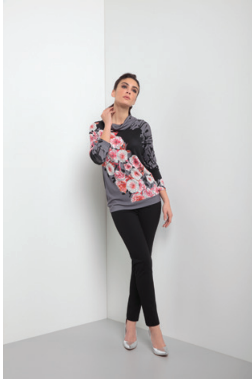
Maglia-Pull 1202 | Pantalone-Pant 1150