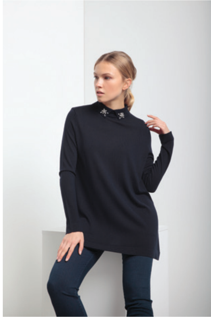
Maglia-Pull 1227 | Jeans 1166