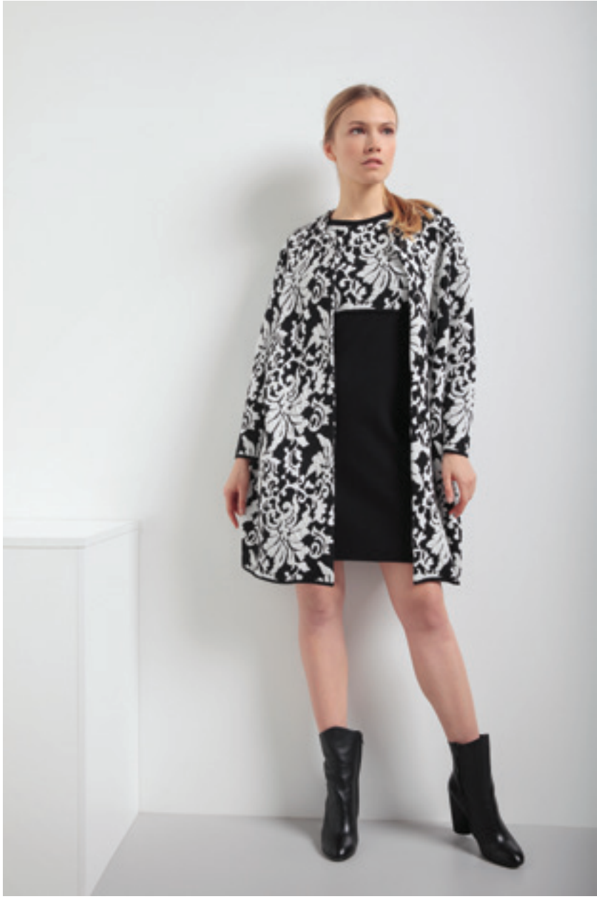
Long Cardigan 1223 | Abito-Dress 1222