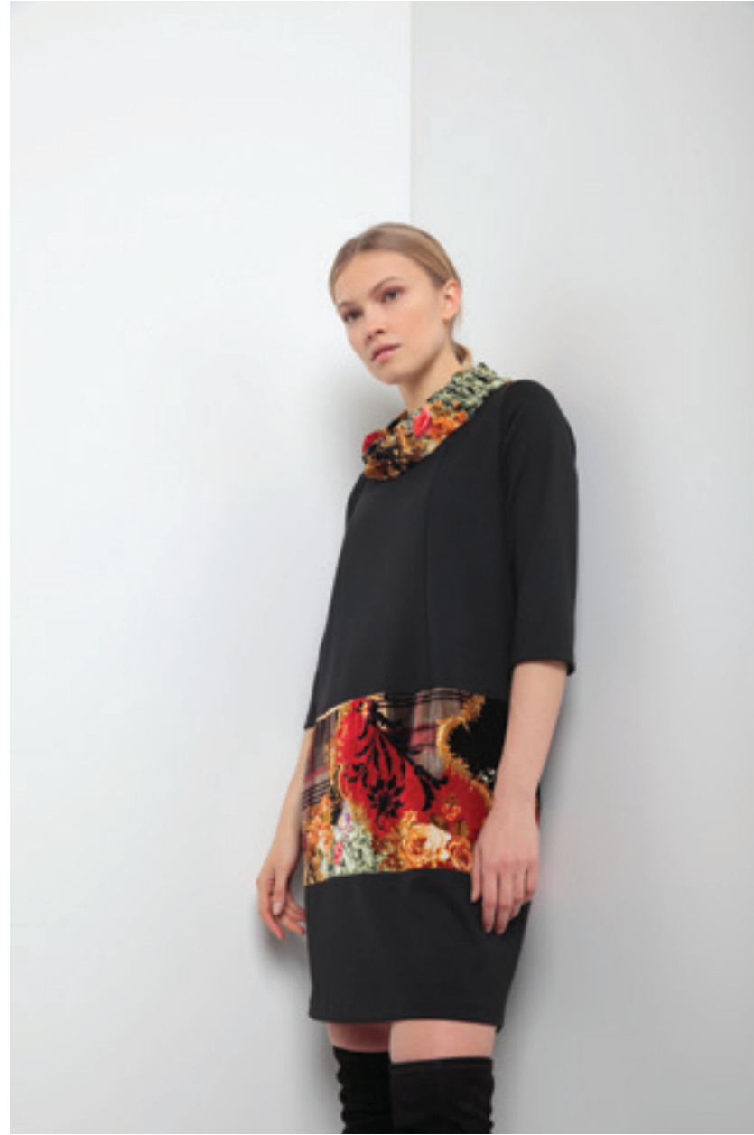
Abito- Dress 1167