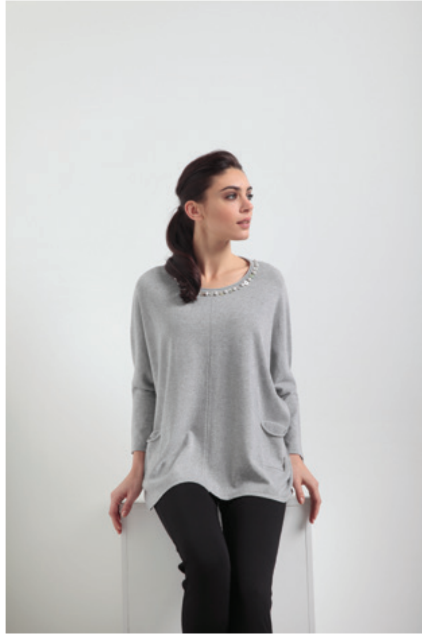
Maglia-Pull 1216 | Pantalone-Pant 1152