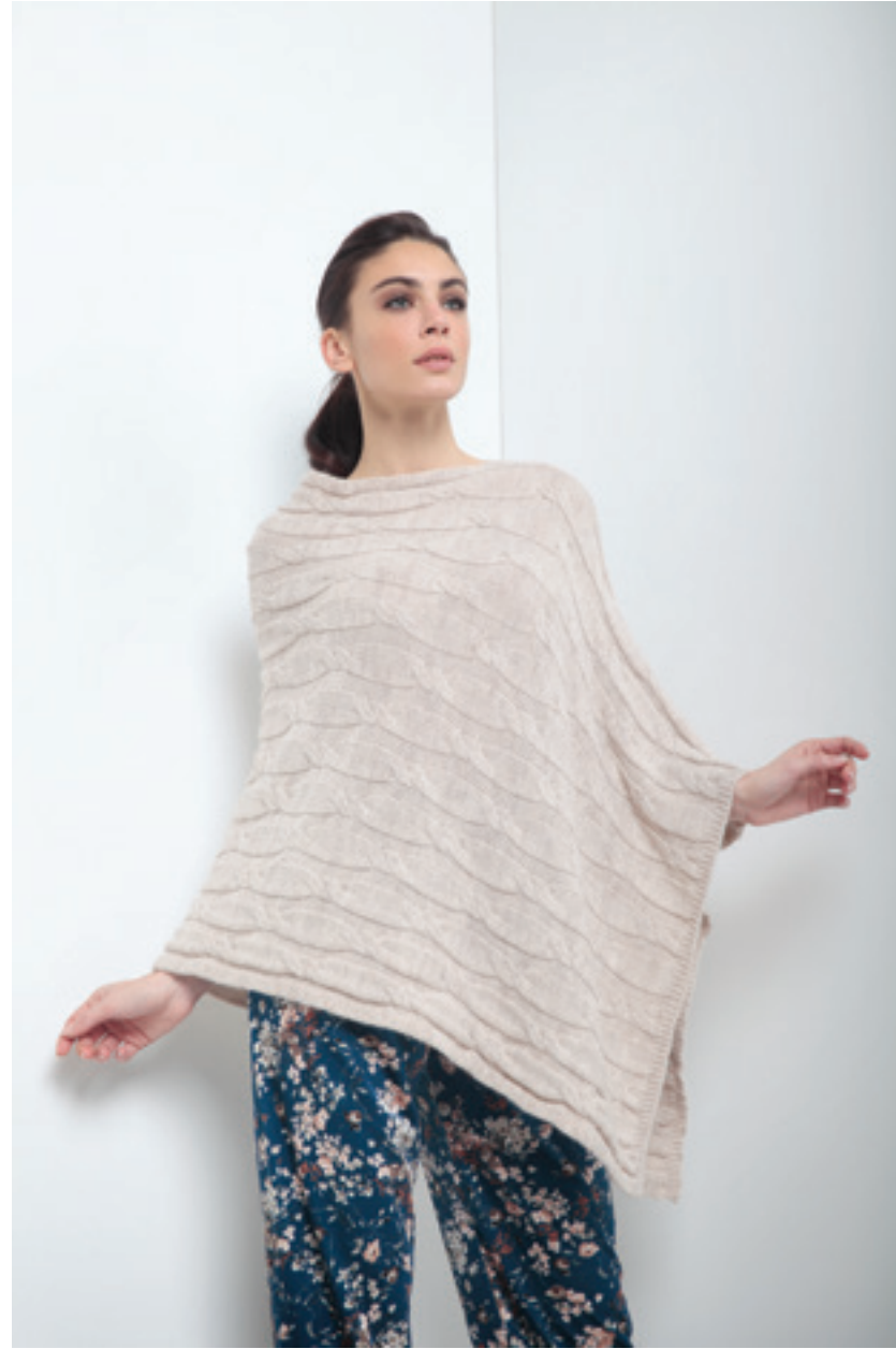
Poncho 1233 | Pantalone-Pant 1231