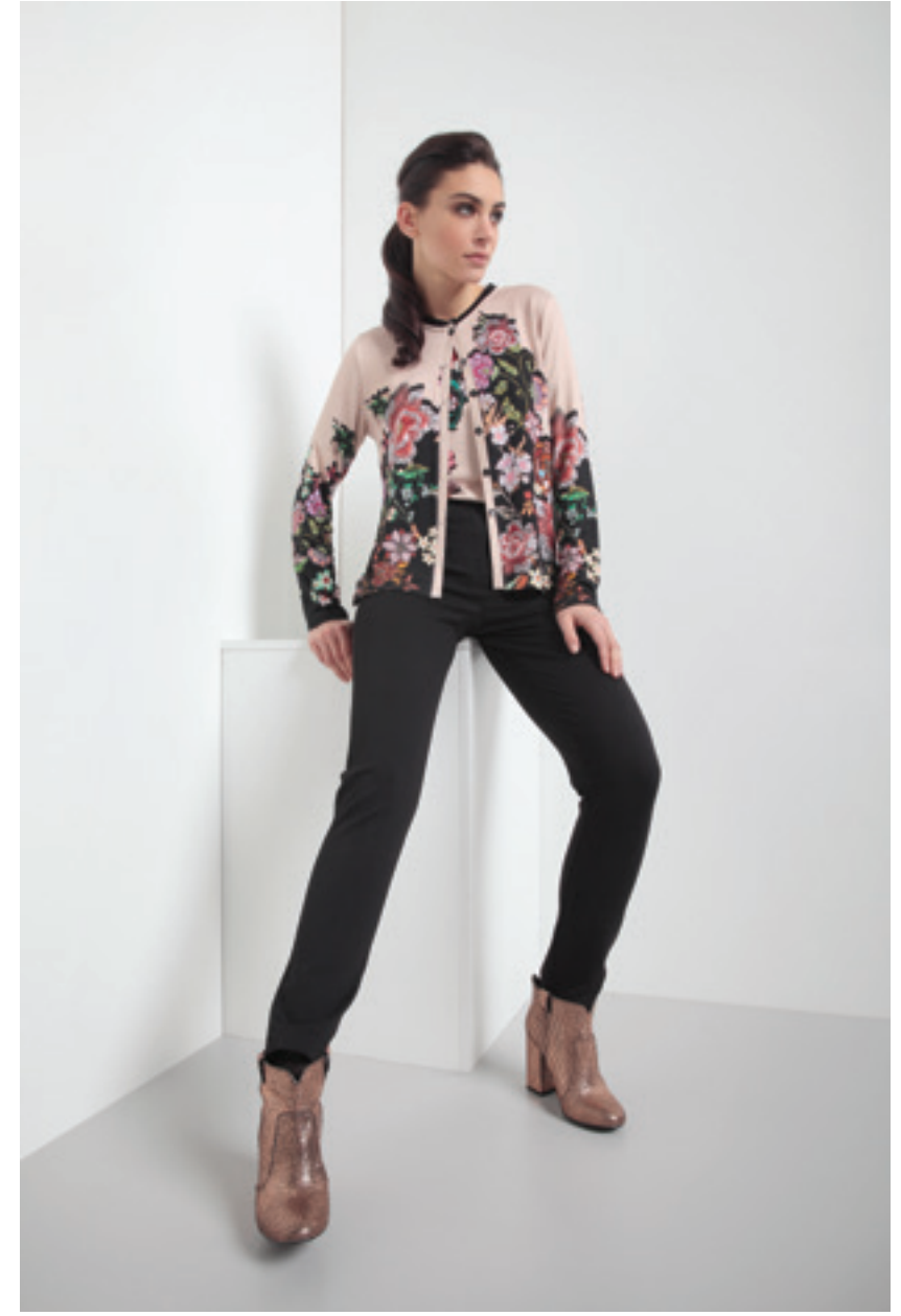
Twin-Set 1207 | Pantalone-Pant 1153