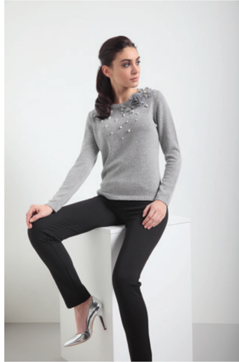
Maglia-Pull 1217 | Pantalone-Pant 1157