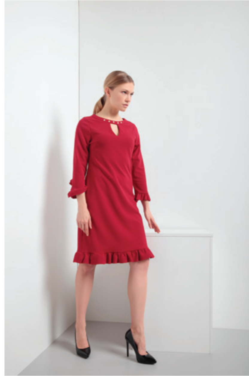
Abito- Dress 1168