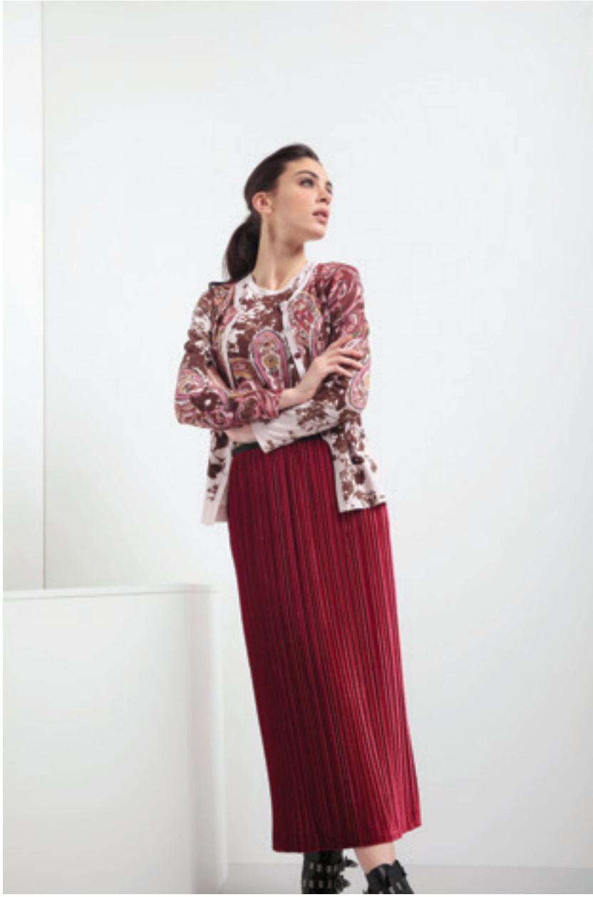
Twin-Set 1193 | Gonna-Skirt 1197