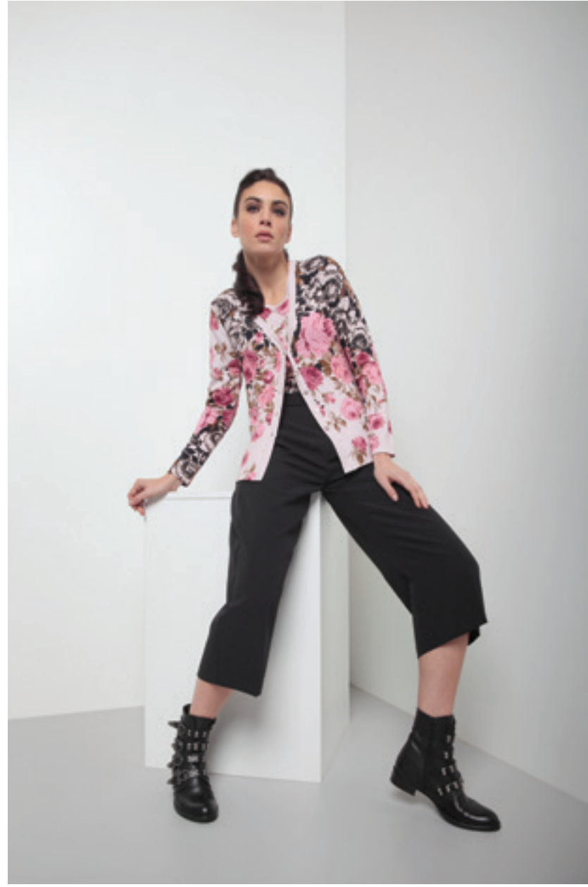
Twin-Set 1190 | Pantalone-Pant 1171