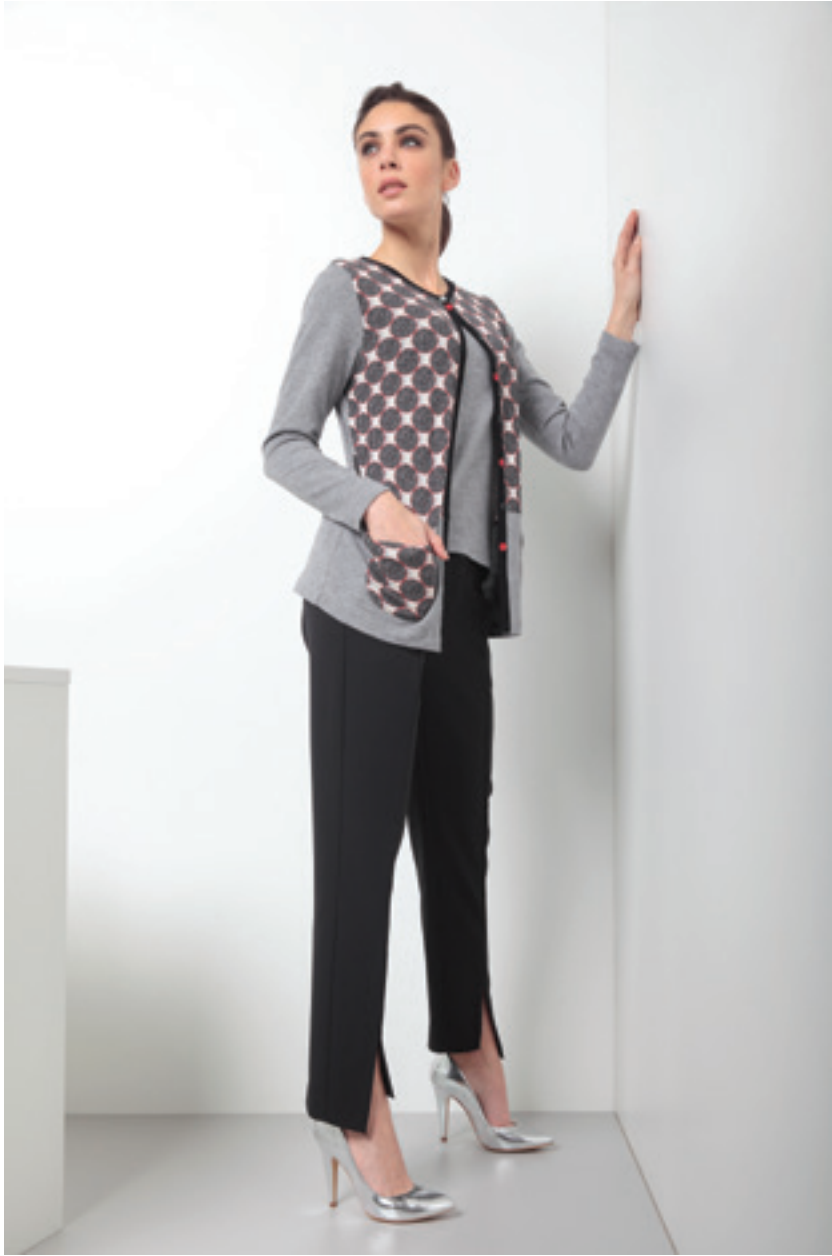
Maglia-Pull 1211 | Pantalone-Pant 1172